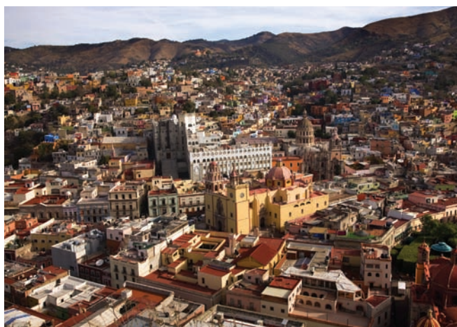
Guanajuato Mexico Overview from Pipila hill